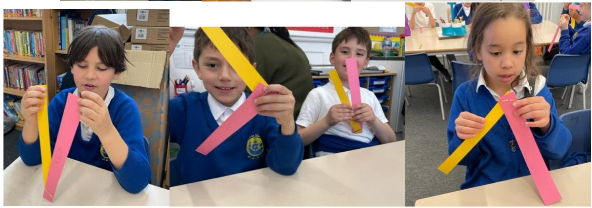
Can't wait to see what the rest of the summer has in store!